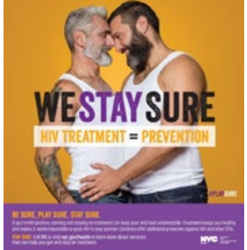
PrEP ads in NYC subway, NYC Department of Health

Why would a school board decide to promote a controversial daily sex pill designed for men who have anonymous sex with men? Is this really the expectation that schools have for their students? Apparently so. The Fairfax County school board voted to promote the daily sex drug to its high schoolers every year, 39 even when the drug was not legal for use by minors. 40